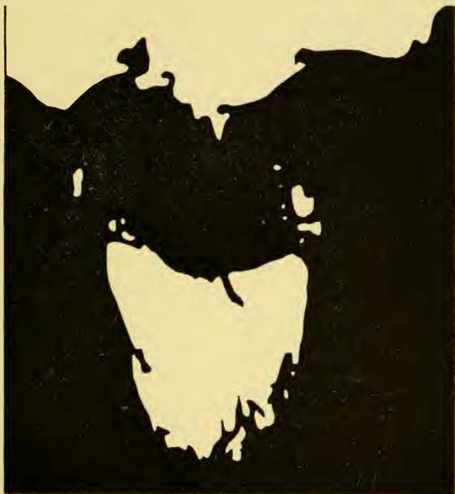
Fig.3.—POST ISTHMIAN (PRESENT DAY).

corded from North Gippsland (Alexandra), which do not approach close enough, in their distribution, to the southern coast of that State to be taken into consideration.